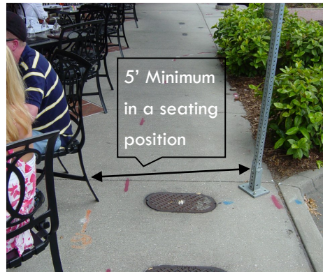
Example of a good clear walk area

One of the most important requirements that we will review often is the Pedestrian Clear-Zone. Maintaining a minimum clearance for wheelchairs, pedestrians, the visually impaired, and strollers access is a City of Sarasota and Federal Law mandate. Refer to American Disable Act's Title VI for more information